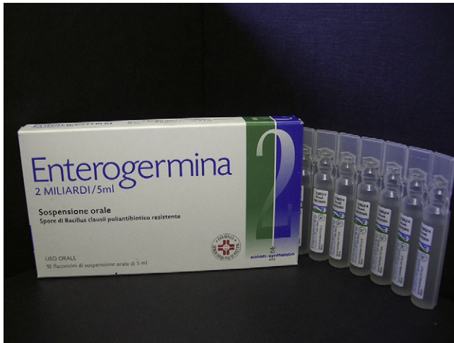
Fig. 2. Enterogermina®. This is a licensed OTC product containing 2 \times 10^9 of GMP-produced spores of B. clausii in 5 ml of water. 2–3 vials are consumed per day to help prevent gastroenteritis in infants and children.

Natto strain it is produced at high levels. Second, it cannot be ruled out that health benefits ascribed to Natto require consumption of both soybeans and bacteria, rather than just the bacterium. In any event, Nattokinase has GRAS status as an enzyme produced from a bacterium in the US and is purified and sold as a health supplement worldwide. In poultry studies controlled trials have shown that oral administration of B. subtilis spores reduce infection by Salmonella enterica serotype Enteritidis, Clostridium perfringens and Escherichia coli O78:K80 (La Ragione et al., 2001; La Ragione and Woodward, 2003).