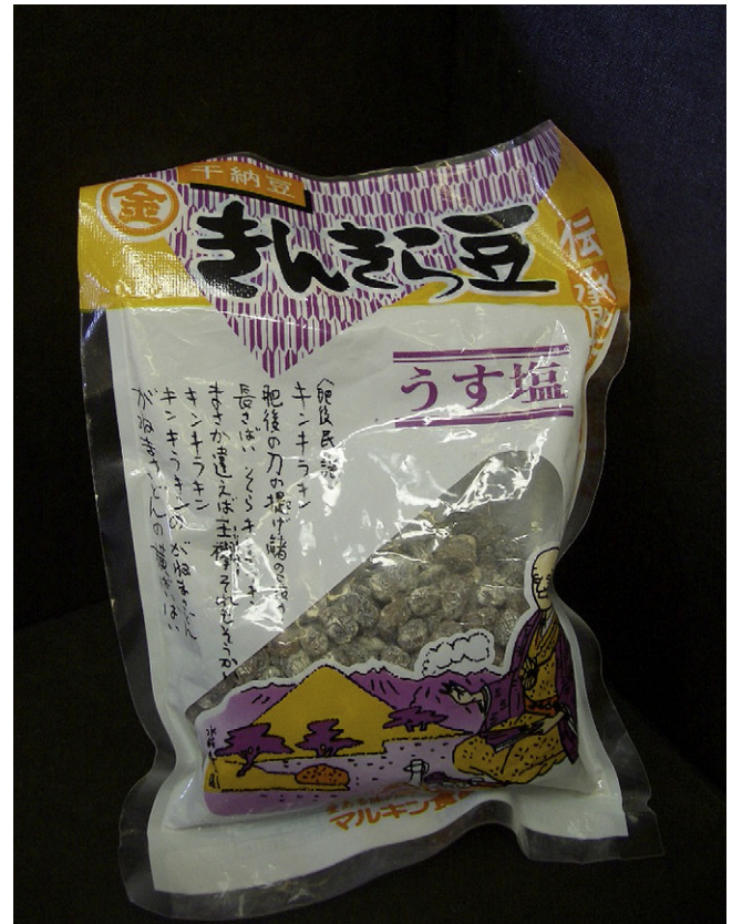
Fig. 4. Natto. Natto is normally consumed as a fermented soybean product either hot or cold. In this example it is sold as a snack with dried soybeans coated with a fine white powder of B. subtilis var. Natto, the active ingredient required for the taste and texture of Natto.

H. pylori (Pinchuk et al., 2001). In the case of BioPlus ® 2B this animal feed product has also been extensively studied with numerous efficacy studies focused on the suppression of gastrointestinal pathogens completed resulting in the registration of this product as a feed supplement in Europe (SCAN, 2000b). It remains unclear whether there is any added benefit in the combined use of the two species.