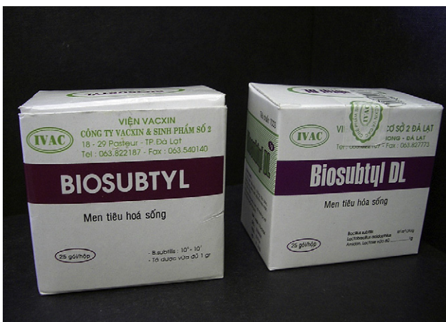
Fig. 3. Biosubtyl and Biosubtyl DL. Typical Vietnamese products, in this case, Biosubtyl that carries spores of B. cereus IP5832 and Biosubtyl DL carrying a mixture of B. cereus IP5832 and Lactobacillus acidophilus . Neither product is labelled properly nor carries the stated dose.

B. subtilis and B. licheniformis are used together in two products, Biosporin and BioPlus ® 2B. BioPlus ® 2B is used in animal feed while Biosporin is licensed as a medicine in the Ukraine and Russia. Biosporin is sold in glass vials that must be reconstituted in water before consumption. The two Bacillus strains, B. subtilis 2335 and B. licheniformis 2336 are well characterised and a number of clinical studies have been used to demonstrate probiotic effects although none been performed with the rigour of a full clinical trial (Bilev, 2002; Osipova et al., 2003, 2005; Sorokulova, 1997; Sorokulova et al., 1997). Interestingly, B. subtilis 2335 has been shown to produce the antibiotic Amicoumacin with in vitro activity against